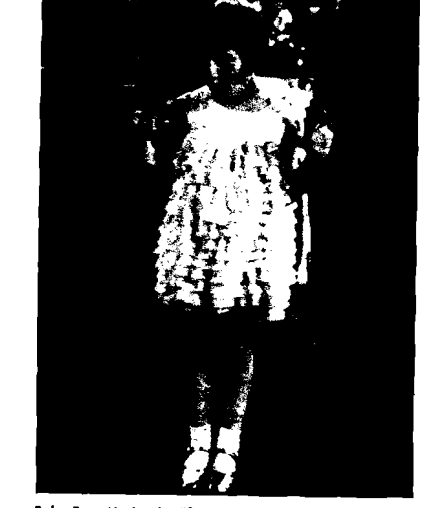
Baby Rose Marie, the "five-year-old child wonder," as her press agent called her, was radio's first child star.

TAPE LIBRARY RATES: 2400' reel-$1.50 per month; 1800' reel-$1.25 per month; 1200' reel-$1.00 per month; cassette and records-$.50 per month. Postage must be in cluded with all orders and here are the rates: For the USA and APO-60¢ for one reel, 35¢ for each additional reel; 35¢ for each cassette and record. For Canada: $1.35 for one reel, 85\phi for each additional reel; 85\phi for each cassette and record. All tapes to Canada are mailed first class.